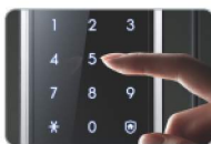
Press the user access code