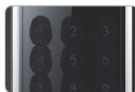
Impossible to guess user access code due to random fingerprint marks