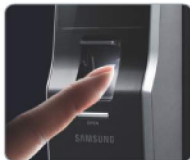
Biometric Access System