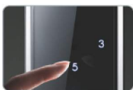
2 random numbers appear before entering user access code

User access code will be pressed after press two random numbers, preventing intruders from checking the fingerprint marks left.