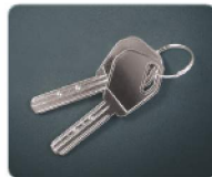
Mechanical Override Keys