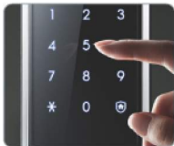
User Access Code